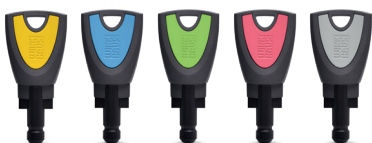
Keys, available in 5 colours